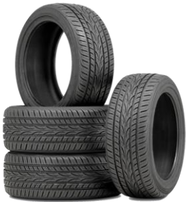
TIRES -- ON & OFF RIMS